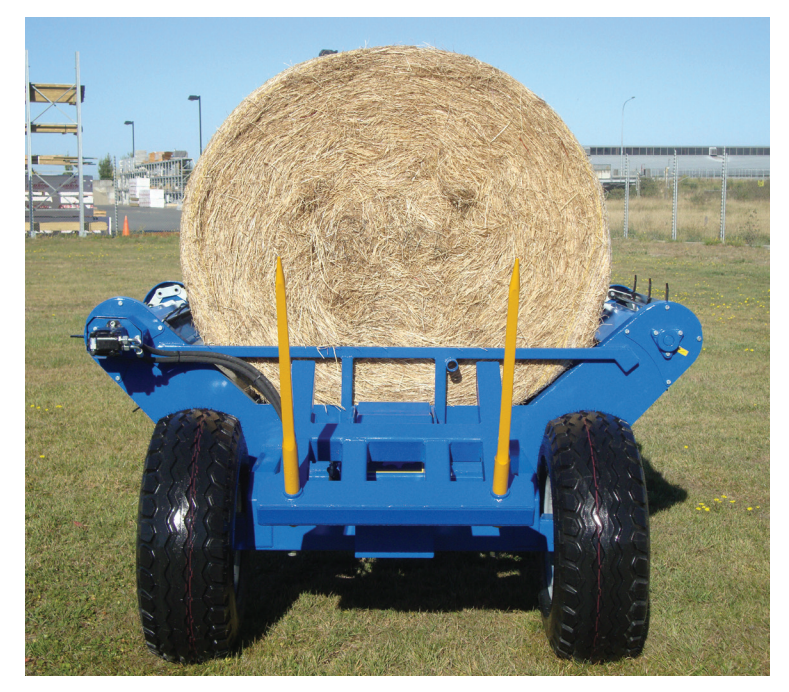
Axles can be adjusted to 3 widths (1620, 1720 & 1940mm) for different land conditions or to fit wider tyres. With the tyres in the above narrow position, the Bale Feeder is still very stable with this 5'3" hay bale