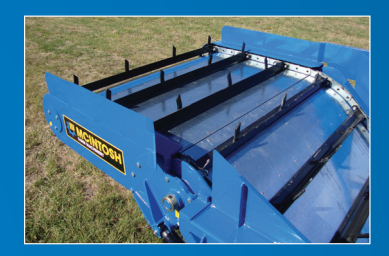
The trough feed arm extends to 2040mm from the centre of the tractor. A hydraulic ram raises the extension to help get through gates