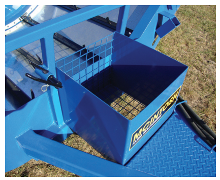
Steel box to hold plastic wrap. The mesh floor allows water and dirt to fall out and reduces the smell compared to an enclosed box