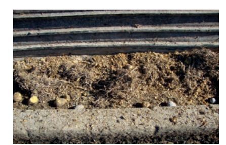
Feeding maize, potatoes and large square bales, the square bale is completely broken up