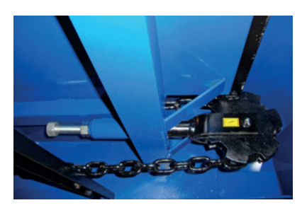
shaft and 24mm threaded rod