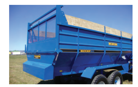
Heavy-duty back door made of 50 x 50 box section to help prevent bending