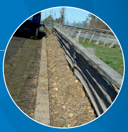
Feeding maize, potatoes and square bales