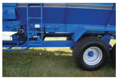
Standard chassis on 500 – 900 models