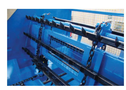
■ The elevator angle allows the front of the wagon to be fully loaded against, and will start every time without the need to back the load off