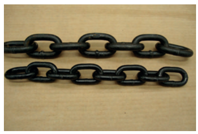
13mm floor and elevator chains used on the Titan Series, giving it double the strength of the 10mm used on Multicrop Wagons