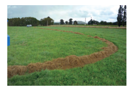
Feeds round bales in a long, even, continuous line – difficult to achieve with a conventional elevator