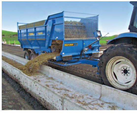
The long throw is ideal for feeding into troughs or under electric fences