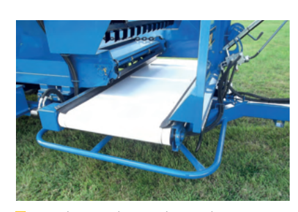
True bumper bars with extra brace on the corner to strengthen and protect the conveyor