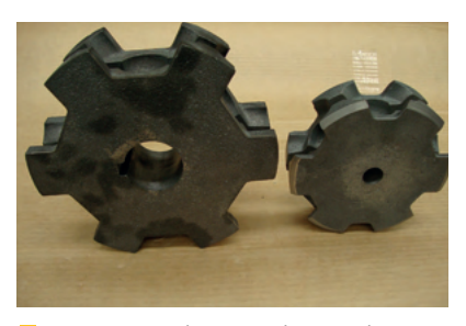
Large 13mm chain sprockets used on the Titan Series for longer life and less maintenance